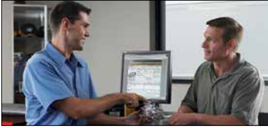
Local service and support