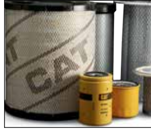
Genuine OEM parts