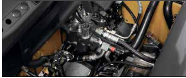
Factory warranty for added protection

Call-out numbers shown in the diagram correspond to the first column of the specifications chart.